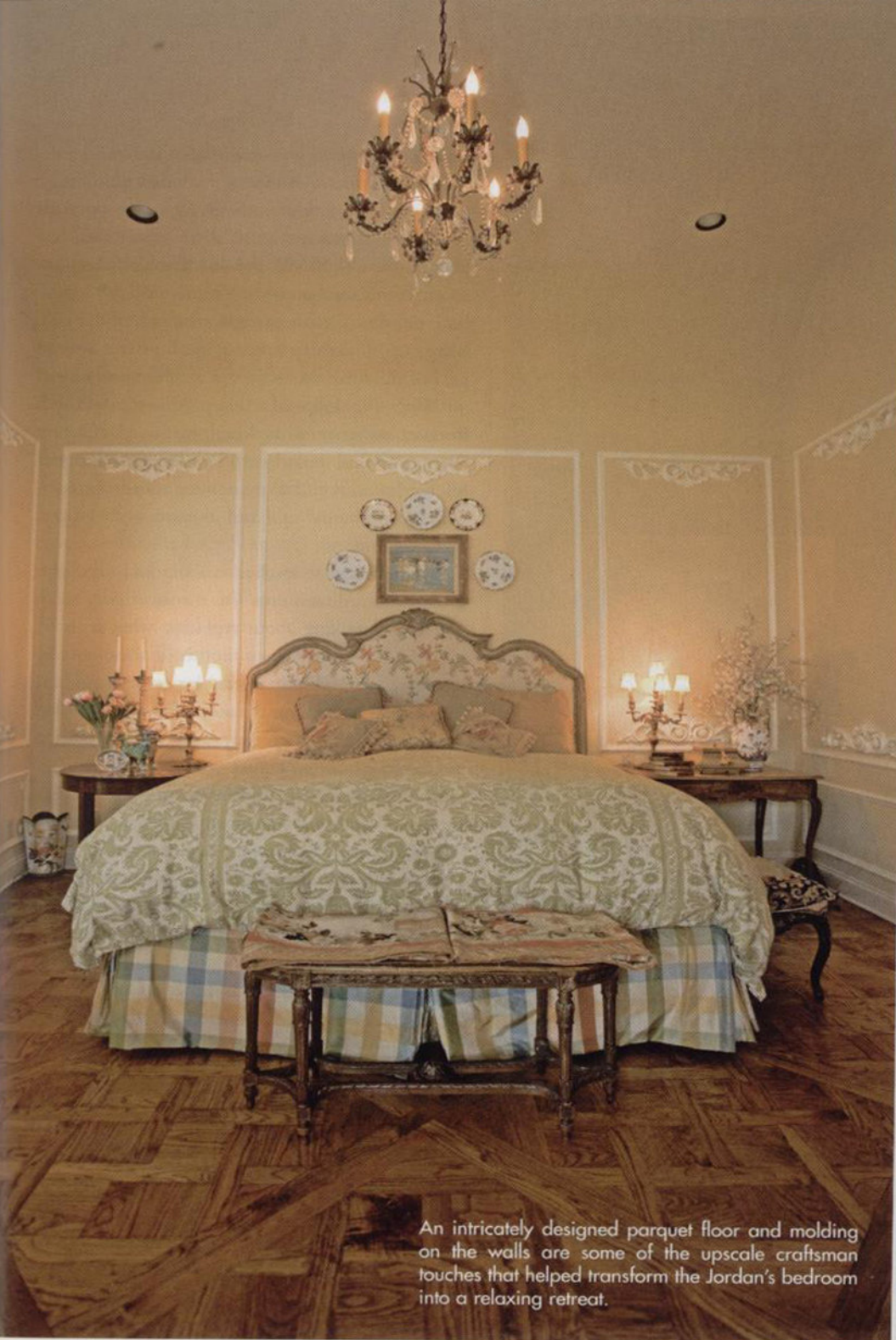
An intricately designed parquet floor and molding on the walls are some of the upscale craftsman touches that helped transform the Jordan's bedroom into a relaxing retreat.