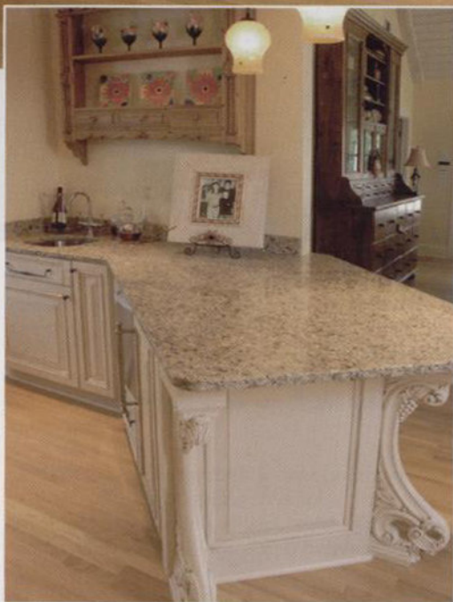
TOP: Innovative kitchen appliances add modern conveniences to a historic home.